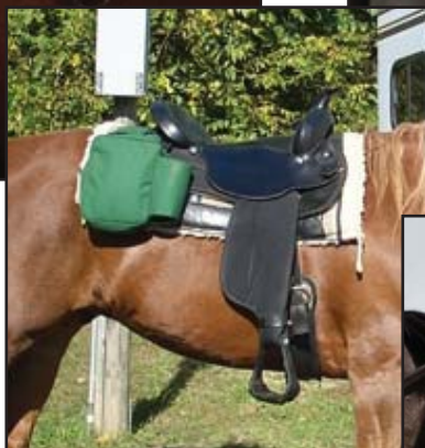
above: Fabtron saddle (saddle bag was not attached when stolen)